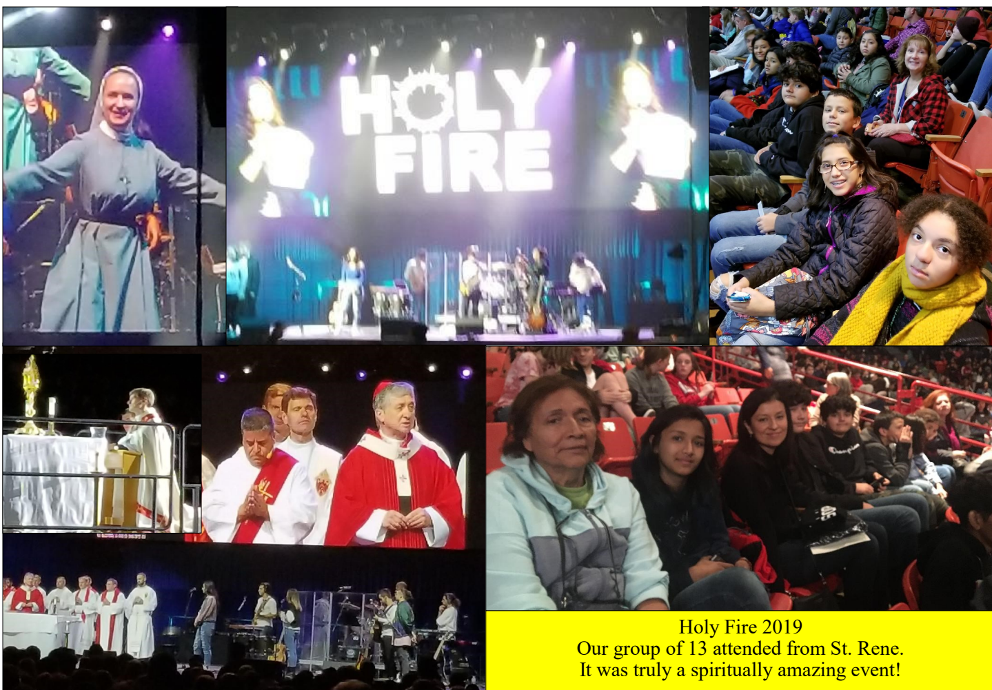
Holy Fire 2019 Our group of 13 attended from St. Rene. It was truly a spiritually amazing event!