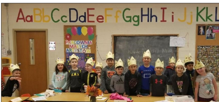
St. Rene Faith Formation Pictured above are our level one students learning about The Saints—God's Superheroes.